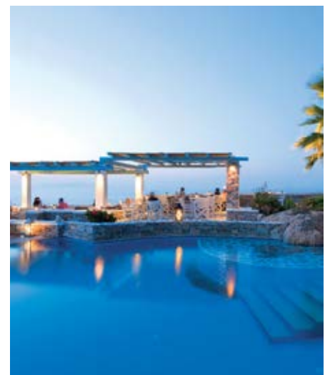
Anemomilos, Chora, Folegandros, Western Cyclades