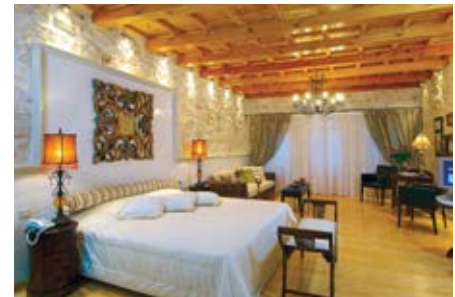
Avli Lounge, Rethymnon Old Town, Crete