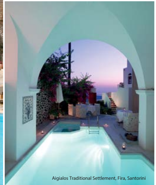
Aigialos Traditional Settlement, Fira, Santorini